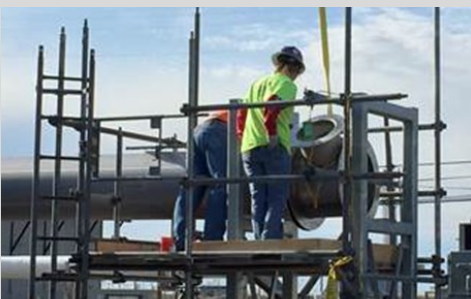
Improving the 40-year-old facility's ventilation system will keep employees, the public and the environment safe from the legacy contamination within the facility.

A radioactive half-life is the amount of time that it takes for the radioactivity of a material to decrease by half. The half-life of both cesium and strontium is about 30 years, meaning it will take 30 years to have half as much radioactive material as we do today.