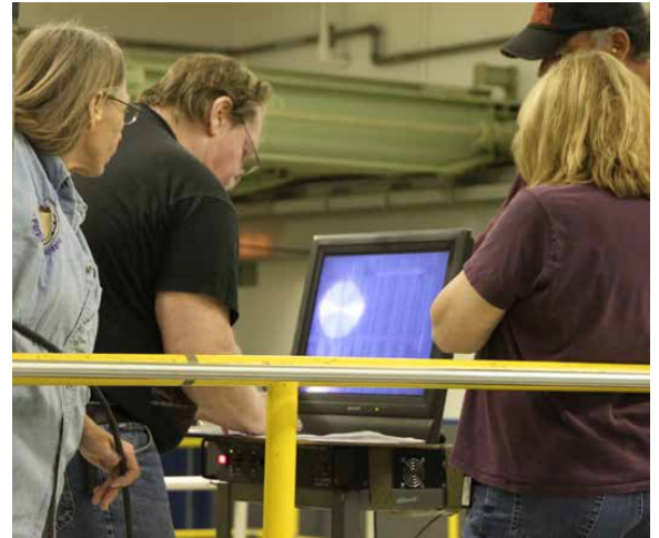
Workers used long-reach tools (left) and video technology (right) as they repositioned the capsules to reduce the heat load of the capsules in underwater storage at WESF.