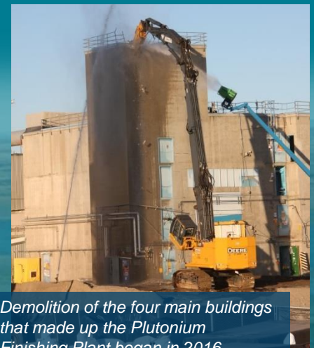
Demolition of the four main buildings that made up the Plutonium Finishing Plant began in 2016.