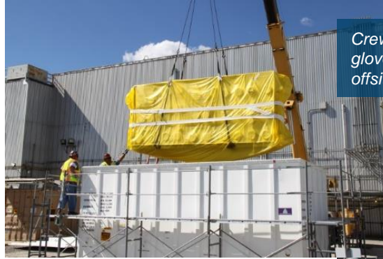
Crews package a glove box for eventual offsite disposal.

Following completion of the main facility, the final activities at PFP include packaging and safe disposal of the rubble from the Plutonium Reclamation Facility, core sampling soil beneath the building pads and stabilization of the site with soil cover. This work is scheduled to be completed by summer 2020.