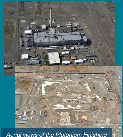
Aerial views of the Plutonium Finishing Plant from 2010 (top) and 2019 (above) show footprint reduction since demolition began in 2016.