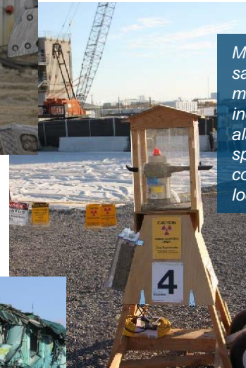
More than 100 sampling and monitoring devices, including monitors that alarm to indicate a spread of contamination, are located near PFP.