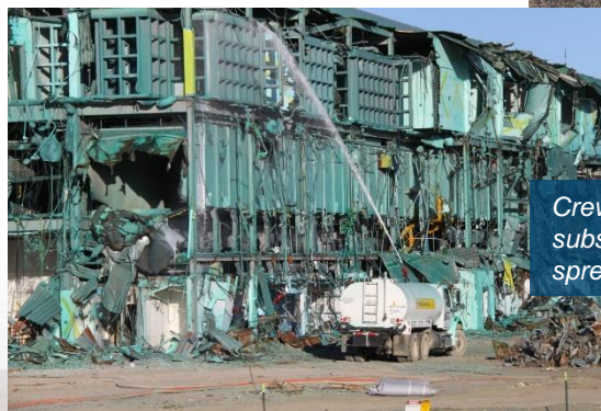
Crews routinely apply a blue paint-like substance, called fixative, to limit the spread of radioactive contamination.