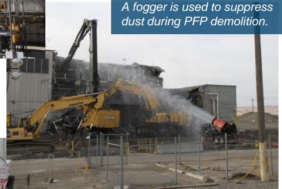
A fogger is used to suppress dust during PFP demolition.