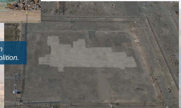
This conceptual illustration shows the PFP after demolition.